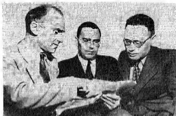
19. Ya. Rokhlin, M. Euwe, M. Botvinnik